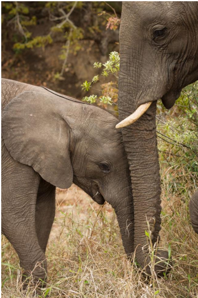
Elephant tender moments.