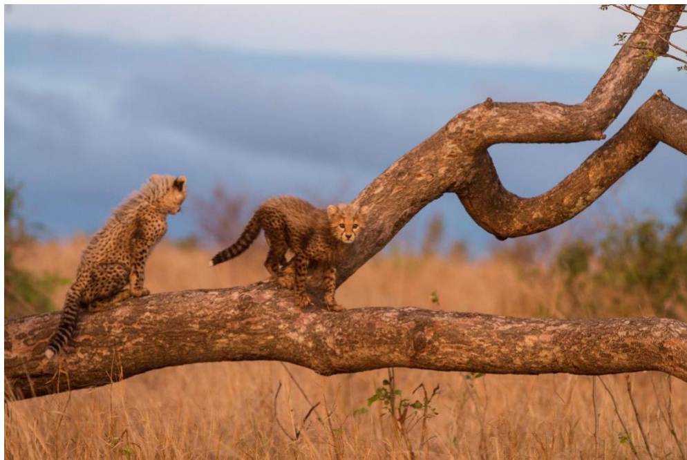
Cheetah cubs on the catwalk...