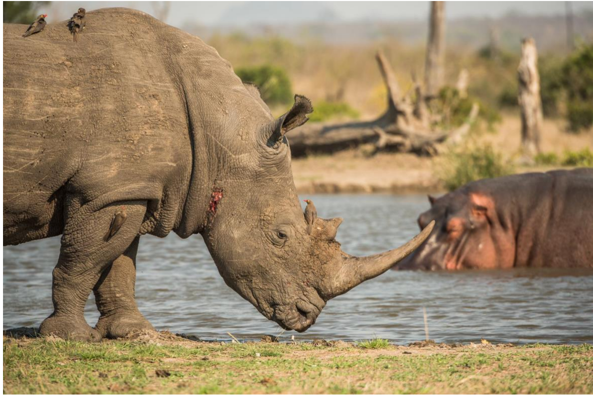
White rhino and hippo.