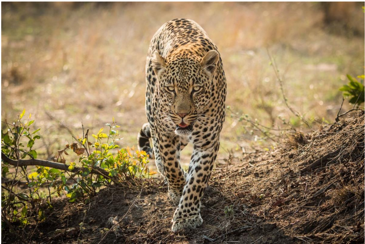
Thamba male leopard, photographed by Gareth Poole