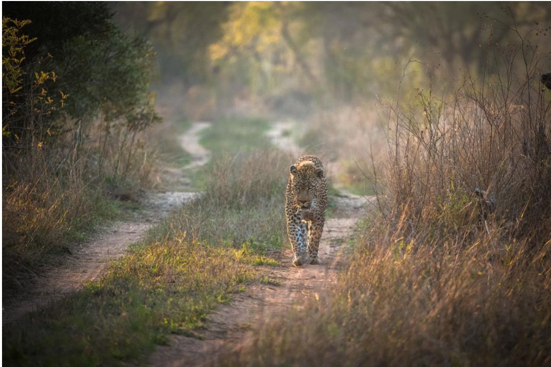
Nyeleti male leopard.