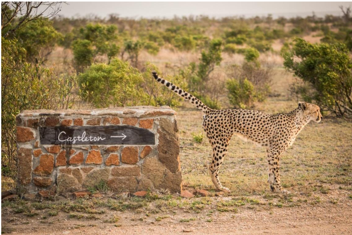
A cheetah claims Castleton as its territory.